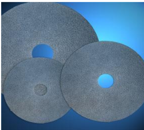
ZIRCONIA GRAIN for METAL SANDING